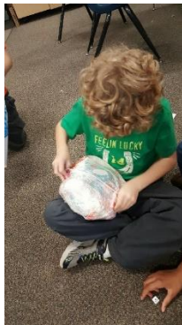
Students at Canyon working together to unwrap a prize ball.

If you have any questions or concerns, please contact the KidZone Office at 623-773-6688.